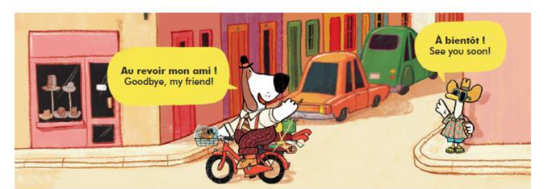
Monsieur Roscoe and Fry have had great fun with all of their friends.

What a wonderful holiday! But now, it's time to go home.